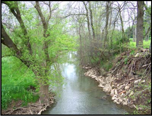
Chartiers Creek near Houston

100 West Beau Street, Suite 105 Washington, PA 15301