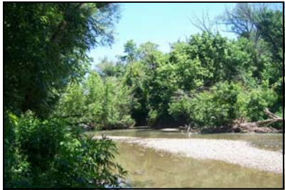
An Island in Chartiers Creek

100 West Beau Street, Suite 105 Washington, PA 15301