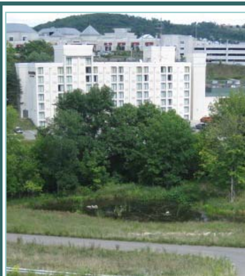
At Tanger Outlets: Detention Pond to help control stormwater runoff